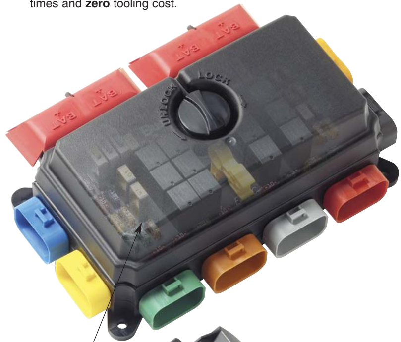
Transparent cover for illustration purposes only.

The customizable designs of the VEC/DVEC enable them to incorporate many different devices and multiple design variations. Splices in the harness can also be eliminated by internally programming them into the grid matrix. The inputs (connector or stud) and outputs (connector) of the VEC/DVEC are color-coded and keyed, and provide quick installation. This makes the module easy to service. The largest benefit of these modules are the reduced lead times and zero tooling cost.